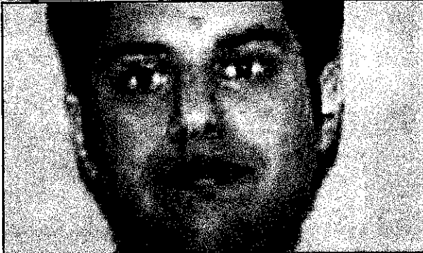
Waleed Al Shehri left the US a year ago, he says

H British Broadcasting Company Sunday, 23 September, 2001, 12:30 GMT 13:30 UK Hijack 'suspects' alive and well