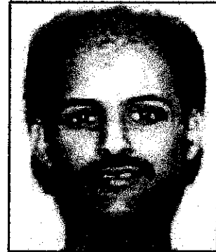
Khalid Al-Midhar may also be alive