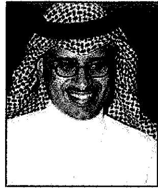
Abdelaziz Al Omari 'lost his passport in Denver'

FBI Director Robert Mueller acknowledged on Thursday that the identity of several of the suicide hijackers is in doubt.